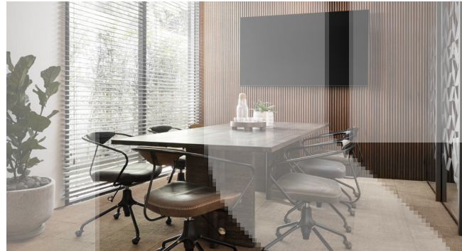
ODOM BUYERS CAN WORK WITH THE INTERIOR DESIGNER OF THEIR CHOICE TO DESIGN THE PERFECT OFFICE SOLUTION. ABOVE IS ONE OF THE LAYOUT OPTIONS PROPOSED FOR THE VERSATILE OFFICE SPACES AVAILABLE AT ODOM FOR COMPANIES OF ALL SIZES.