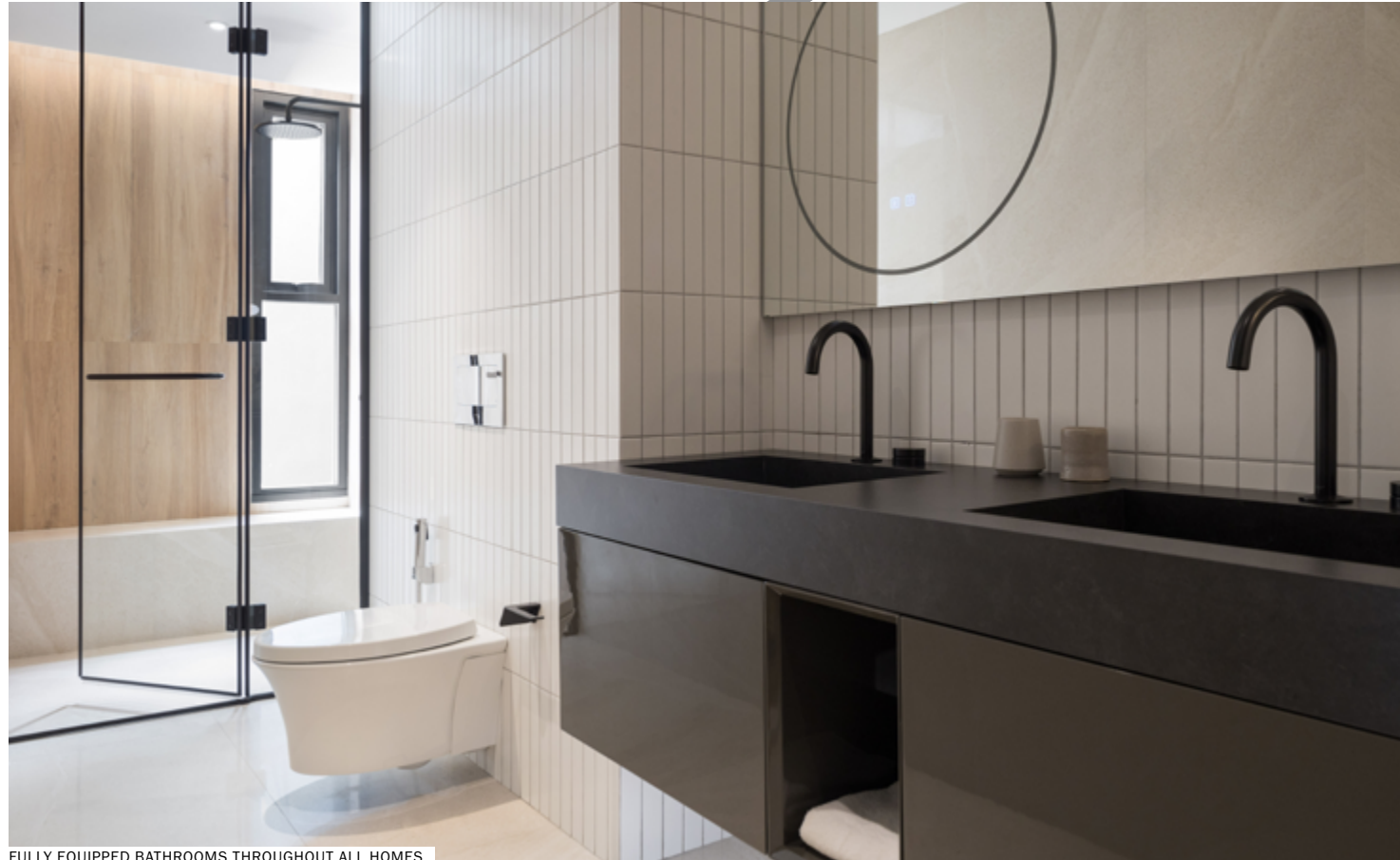
FULLY EQUIPPED BATHROOMS THROUGHOUT ALL HOMES.