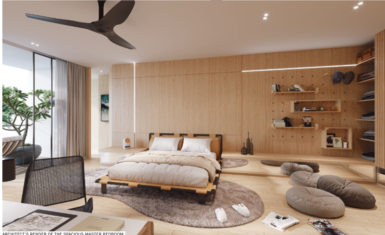
ARCHITECT'S RENDER OF THE SPACIOUS MASTER BEDROOM