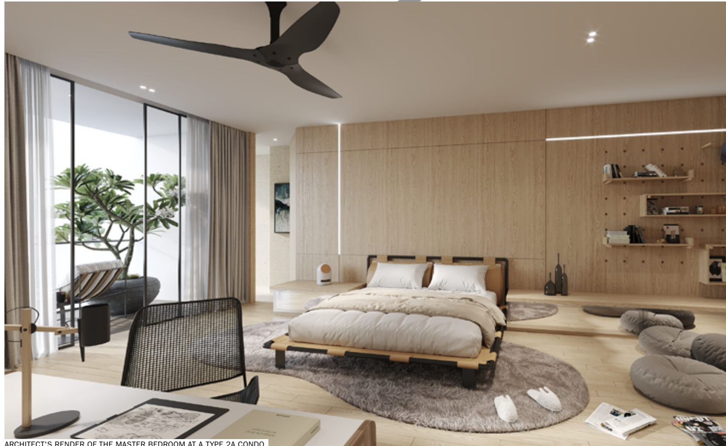
ARCHITECT'S RENDER OF THE MASTER BEDROOM AT A TYPE 2A CONDO